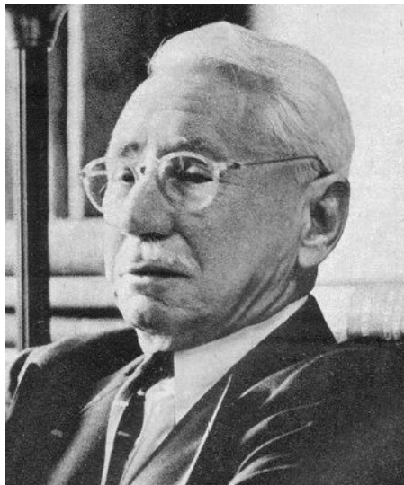
Will Durant 1963

Cultural progress appears to have distanced us from a [supposed] earlier integration with the rest of the world. Recently, the spread of specialisation, professionalism, and [oh paradox!] education, has denied most members the chance to practice old skills or learn new ones. This is why such earnest titles as The handbook of sustainability literacy. Skills for a changing world appear on the bookshelves, and why it is important to use them. This particular volume is a wide-ranging collection of articles on the 'litteracies' we need to be able – literally and metaphorically – to 'read' our culture.